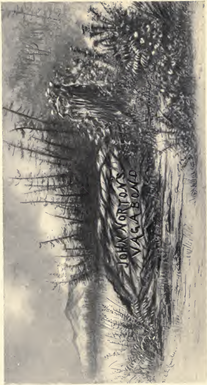
THE VAGABOND'S ROCK.